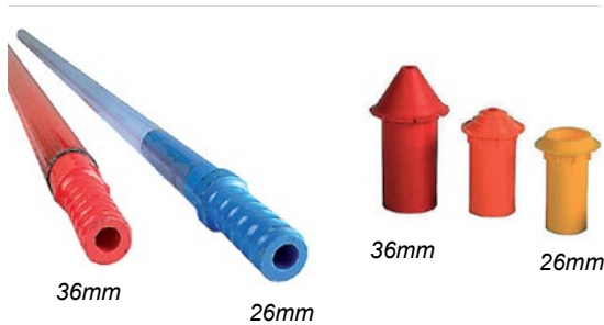
Figure 2 - Insertion Tubes & Caps

The Quick-Chem caps are normally packaged in plastic bags placed within the Lokset resin cartons. Caps to suit nominal 25mm, 26mm, 30mm and 36mm diameter capsules are available.